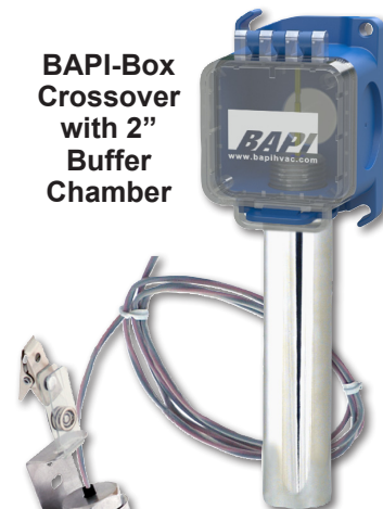
1" Hanging Bracket