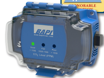
Rough Service Sensor