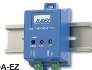
VC350A-EZ Voltage Converter

The CO 2 unit requires 240mA of current to operate correctly. If this is more current than can be provided by the controller power output, then the unit can be powered by a BAPI VC350A or VC350A-EZ Voltage Converter. See the Accessories section for more info.